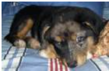
Who wouldn't love this face?